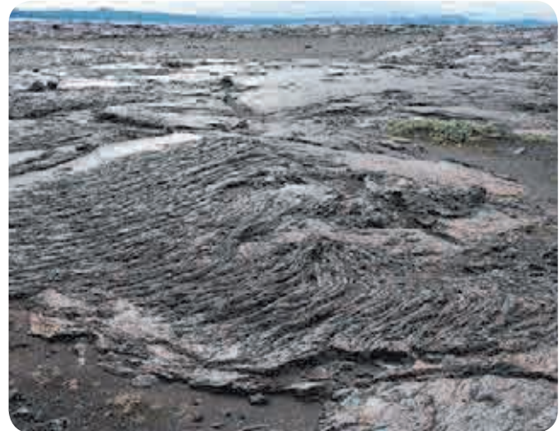
Fig. 6.4 : Ropy Lava

accessory amount of biotite and hornblende. Olivine may or may not be present. It shows compact, vesicular, amygdaloidal, pipe amygdaloidal, pillow and columnar structure. The cavities in vesicular basalts are filled with secondary minerals like heulandite stilbite, apophyllite, quartz, amethyst, chalcedony, agate, jasper, opal, calcite etc. Ropy lava structure, columnar joints are commonly observed in basalts (Fig.6.4 and 6.5).