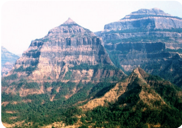
Fig. 6.3 : Stratigraphic exposures of lava flows in Malshej Ghat area of Maharashtra

districts in Vidarbha region and Ratnagiri and Sindhudurg districts in coastal Konkan. Two types of lava flows are recognized. They are the pahoehoe or ropy lava and the 'aa' or blocky lava. Pahoehoe lava flows predominate in Dhule, Aurangabad, Pune and Nasik districts, whereas in rest of Maharashtra, 'aa' lava flows are dominantly exposed. In Maharashtra between some flows intertrappean beds of lacustrine origin are found. Red bole beds commonly occur in between two lava flows. The flows are intruded by number of dolerite dykes trending nearly N-S, parallel to the west coast. East-west trending dykes are commonly exposed in northern part of Maharashtra around Nandurbar, Dhule and Jalgaon districts.