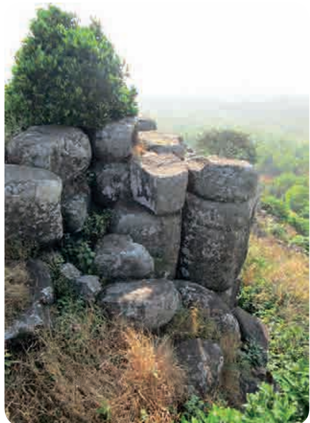
Fig. 6.5 : Columnar joints, Tumzai Hills, Panhala